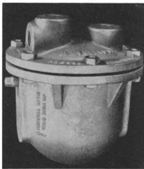
A new V. D. Anderson No. 81 float-type moisture trap is now available to fill the need for a simplified, low-cost, float trap on air, gas, and steam applications. It is identified as Drawing S-1555.